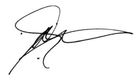
Pour la République des Seychelles